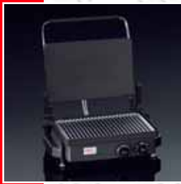
With roasting griddle