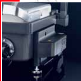
Height adjustable feet