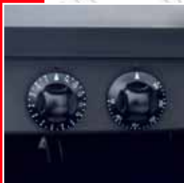
Time and temperature regulation

Upper hood made of highest grade stainless steel, easy to clean