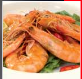
Quality preserving and energy saving grilling technology