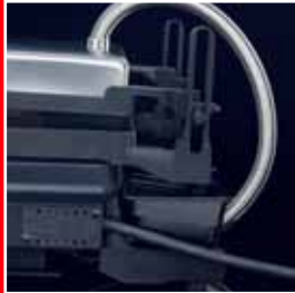
Self adjusting height of top plate